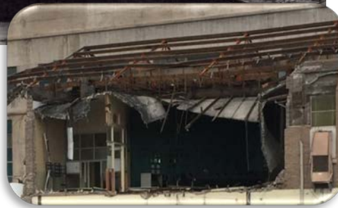
Playford A Power Station Control Room 2016

In 1959 work proceeded on the erection of a concrete stack 260 feet high which replaced the existing stacks with the aim to carry the exhaust gases high enough to clear the township of Port Augusta. On 9 September 2016 this stack was felled.