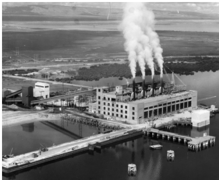
Original Playford A Power Station

The 90MW Playford A Power Station was commissioned on reclaimed land at the northern tip of Spencer Gulf in 1954 .