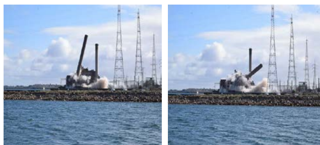
Playford A Power Station Stack Felling – September 2016

Flinders Power Augusta Power Stations Power Station Road Port Augusta PO Box 15, Port Augusta SA, 5700