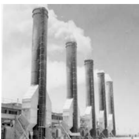
Playford A Power Station Original Stacks